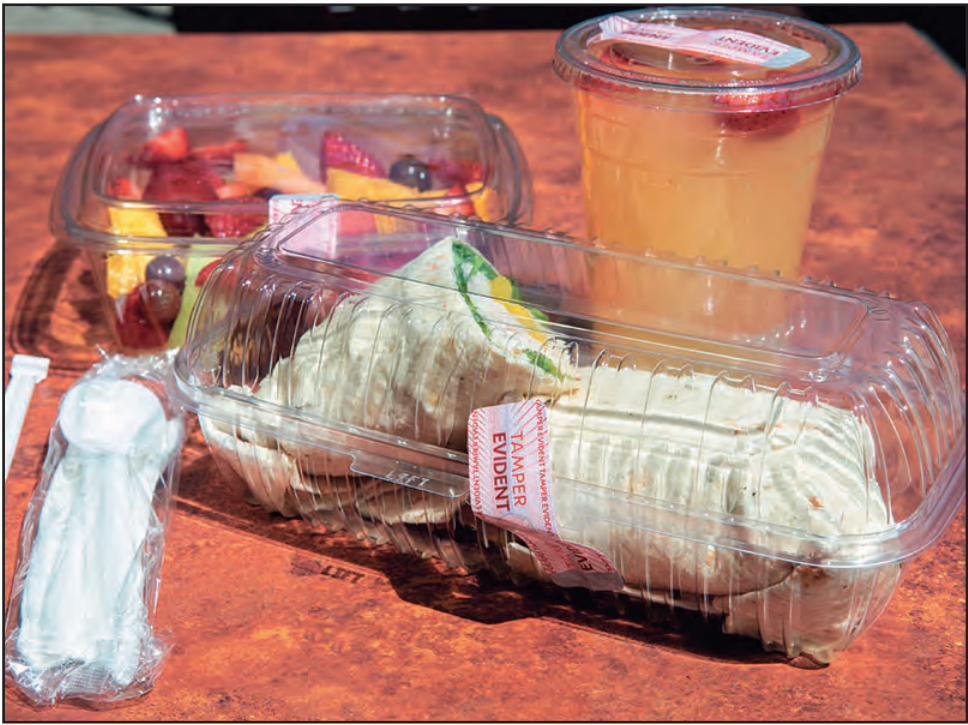
ABOVE: GrubHub’s tamper-proof packaging guarantees a safe kitchen-to-customer experience at Everyday’s a Sunday café.