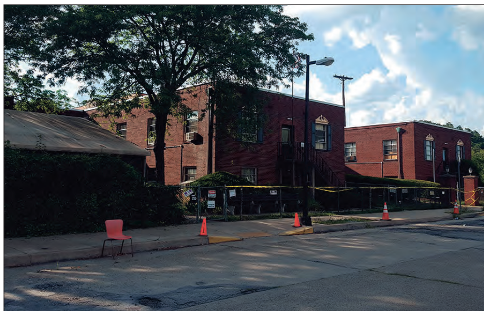
ABOVE: The former Angelus Convalescent Center in the 200 block of Amber St. in East Liberty.