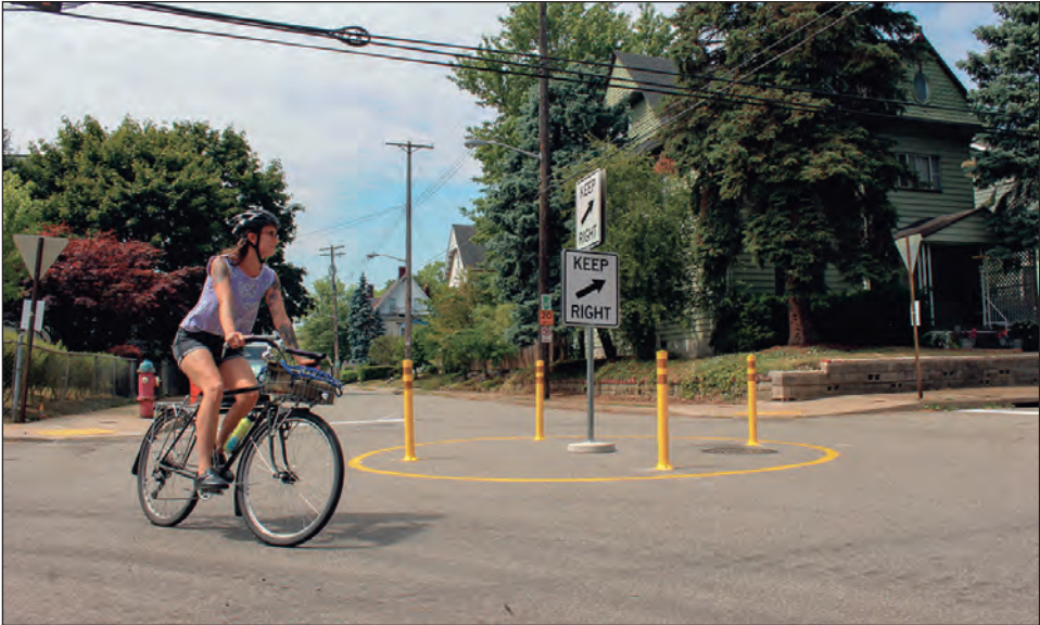
ABOVE: Keeping right through the new traffic curve, a cyclist cruises along N. Euclid Ave.

“One tool outlined in the plan is ‘traffic calming’ because, if a road is slowed down, it’s not only safer for bicyclists, but it’s also safer for pedestrians, drivers, and residents on the street,” Lucas noted. “Basically, we can achieve multiple goals, while also helping create a well-connected bike network.” Stay tuned for updates at MoveForwardPGH.org . ♦