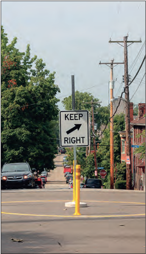
ABOVE: New signage warns drivers of the impending roundabout on N. Euclid Ave. These temporary “traffic calming” installations could become permanent features in the near future.

“We eventually plan to ‘traffic calm’ North Euclid Avenue in its entirety, but we wanted to pilot the idea first,” Lucas said.