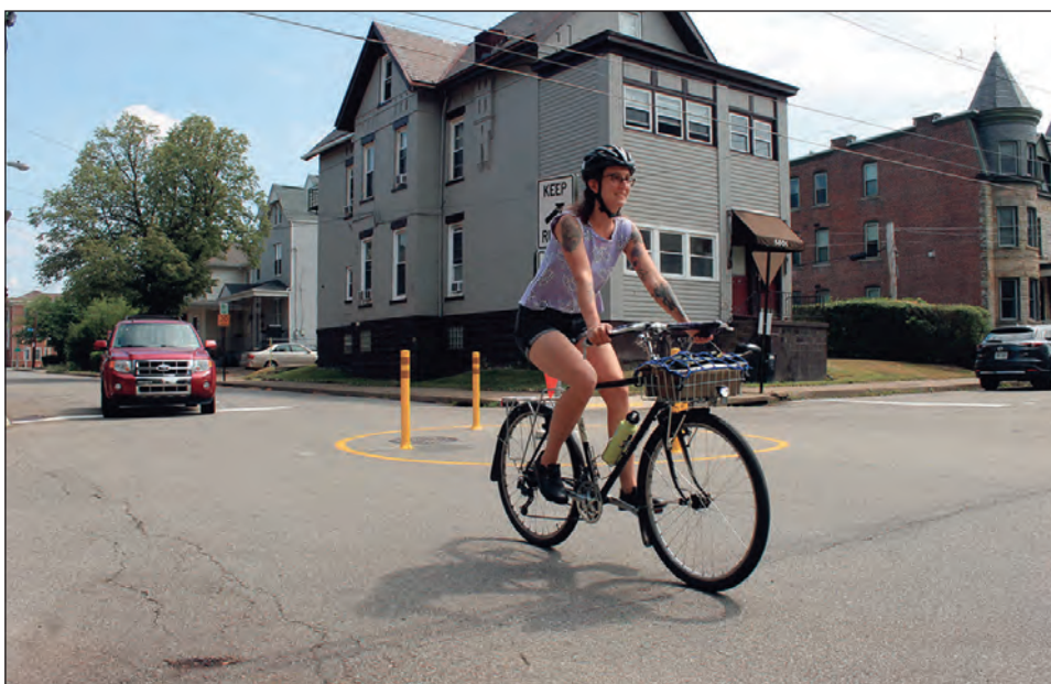
ABOVE: A cyclist navigates new “neighborhood traffic circles” in Highland Park. Read more at right.