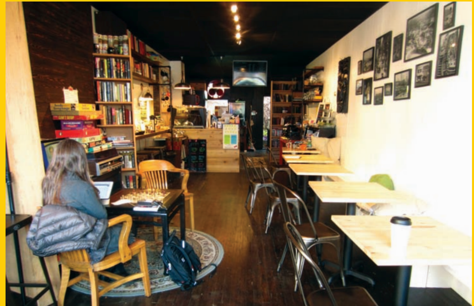
ABOVE: Closing time on Sunday finds one last customer enjoying the ambiance of the Bookshelf Café (1806 Chislett St.) in Morningside. Since opening in August, the café already has a good local following in what is quickly becoming a destination neighborhood.