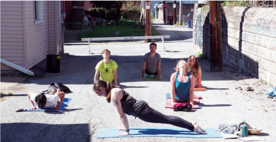
BELOW: Bloomfield neighbors partake in an alleyway yoga session on Oct. 10 as part of their neighborhood's Stoop City celebrations; the event was aimed to re-contextualize our everyday environment in more humane, meditative terms.

ModernFormations Gallery and Performance Space, 4919 Penn Avenue at 8 p.m. The Amish Monkeys improv troupe will perform a full-length show, lasting between 80 and 120 minutes. Admission is $9, cash or credit only. Seating is limited. For reservations, call the Gemini Theater at 412-243-6464. Content is generally PG-13. Check out http://amishmonkeys.com for more information.