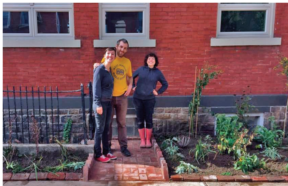
ABOVE: Garfield neighbors reflect on a job well done after planting shrubs and vegetables in front of the center on N. Pacific Ave. As long as they are beautifying the neighborhood, these local volunteers never mind getting their hands dirty.