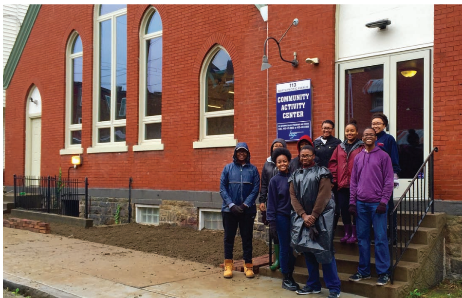
ABOVE: After clearing away debris and leveling the ground outside the Community Activity Center (113 N. Pacific Ave.) in Garfield, a group of volunteers from Carnegie Mellon University posed beside their handiwork.