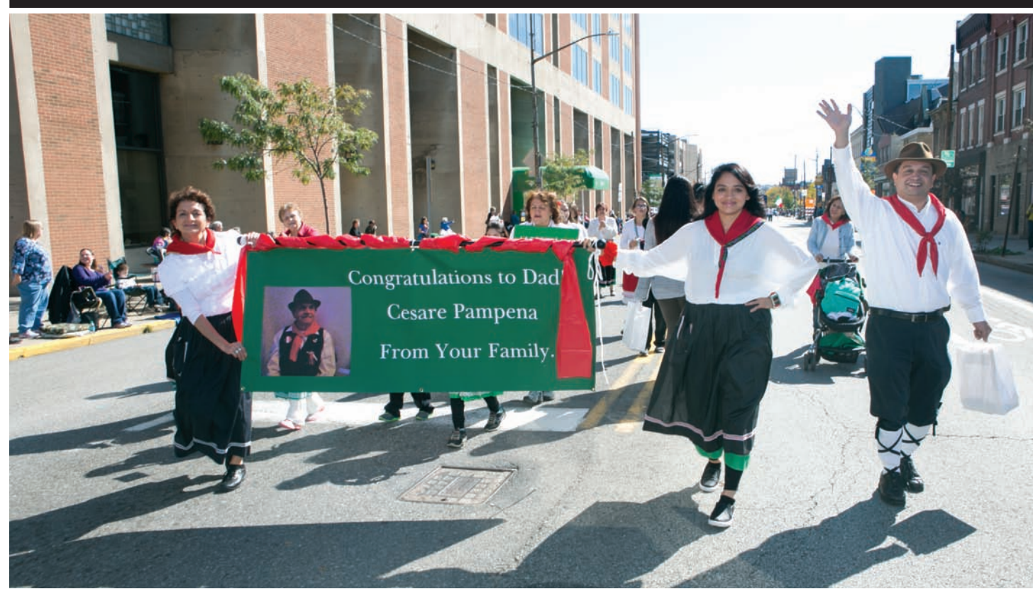
ABOVE: Local residents march down Liberty Ave. on Saturday, Oct. 10, as the Columbus Day Parade makes its way through Bloomfield. Many participants, like the Pampena family (pictured above), paraded their family pride around the streets as they celebrated ethnic heritage for the holiday. Have another look at the Columbus Day Parade festivities on Page 10.