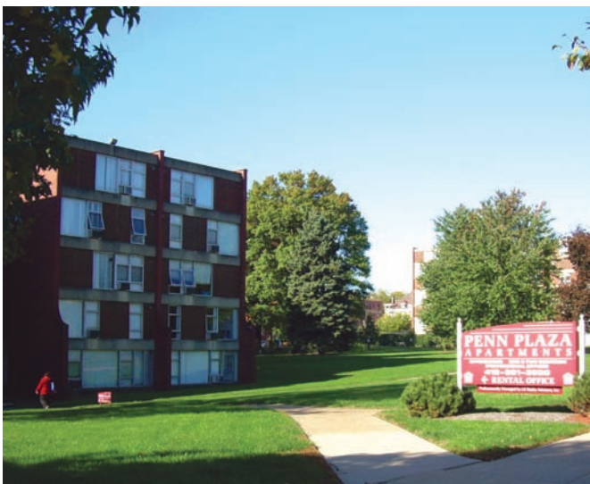
ABOVE: The sign for Penn Plaza Apartments at 5600 Penn Ave. might as well be one giant eviction notice to the property's East Liberty tenants. The City has negotiated a deal with Penn Plaza's owners to relocate all occupants from both buildings before re-zoning the site for commercial development.