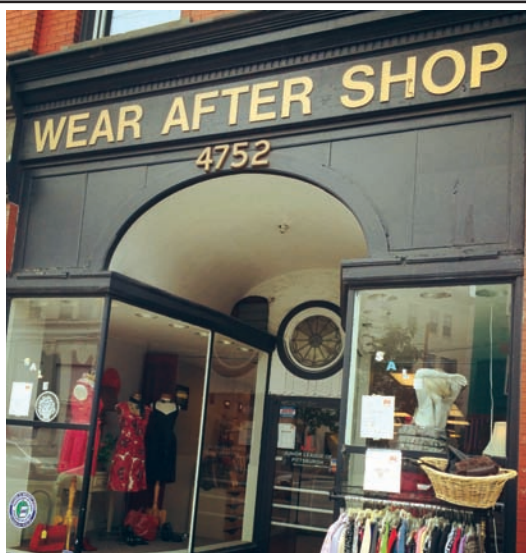
ABOVE: After ninety years of dedicated service to its East End customers, the Wear After Shop (4752 Liberty Ave.) in Bloomfield is closing its doors for good on Nov. 21. A year-round, brick-and-mortar fundraiser for the Junior League of Pittsburgh, the resale store is no longer profitable enough to support the JLP's community mission in the East End.

Without such a welcoming neighborhood and dedicated staff volunteers, the Wear