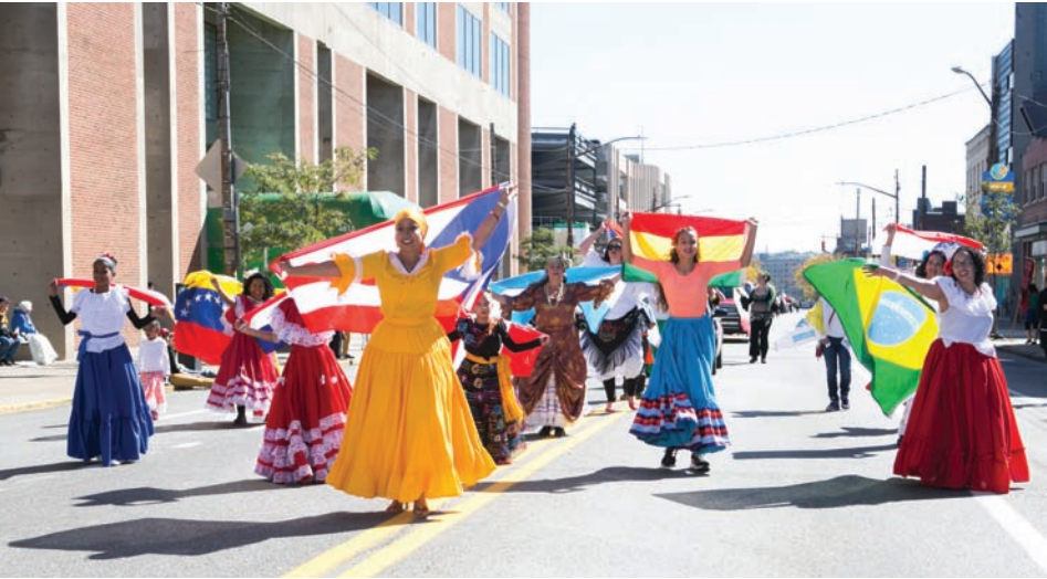
ABOVE: During the Columbus Day Parade, participants fly flags from all over the Americas on Bloomfield's Liberty Ave. Although it means a lot of different things to a lot of different people, Columbus Day has come to represent a "smorgasborde" of American pride.