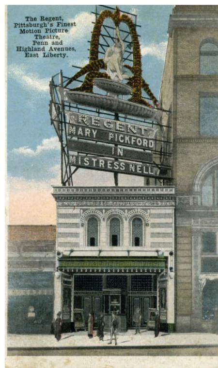
ABOVE: Kelly Strayhorn Theater originally opened in 1914 as the 1,100-seat Regent Theatre, which housed one of the first nickelodeons in the country.