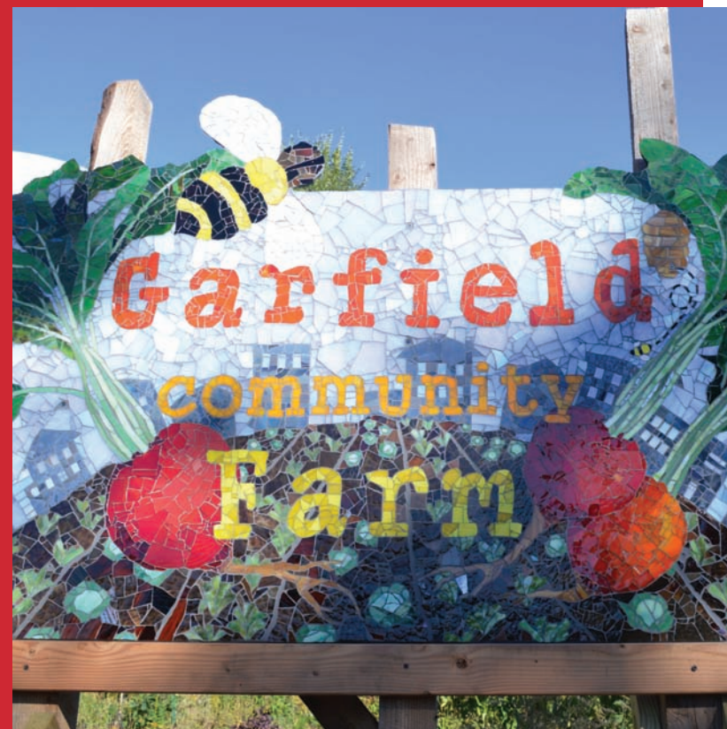
ABOVE: Garfield Community Farm is one of the East End sites hosting a PULSE participant this year.

She said she’s enjoying her service in the Garfield community and is open to staying in Pittsburgh after her service ends in July 2015.