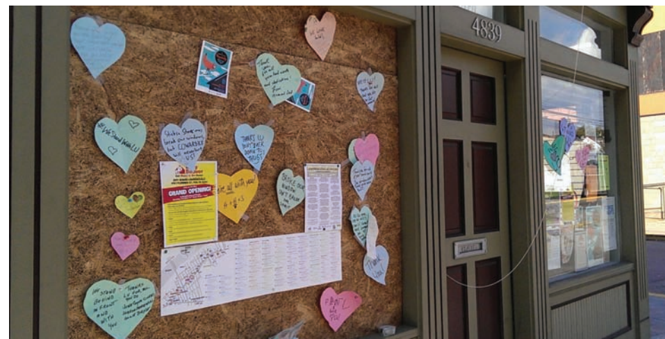
ABOVE: After someone broke Lawrenceville United's office window with a brick in September, community members wrote encouraging messages on paper hearts. They also showed support on social media with the hashtag #WeStandWithLU.

"In the '80 and '90s, the BGC had to confront the problems that a number of bars and clubs were causing on Penn Avenue," Swartz told The Bulletin. "Their places were the backdrop for homicides, trafficking in cocaine and heroin, assaults, prostitution, and fencing of stolen property, all happening within our commercial district. It overshadowed the more legitimate tavern owners and made life