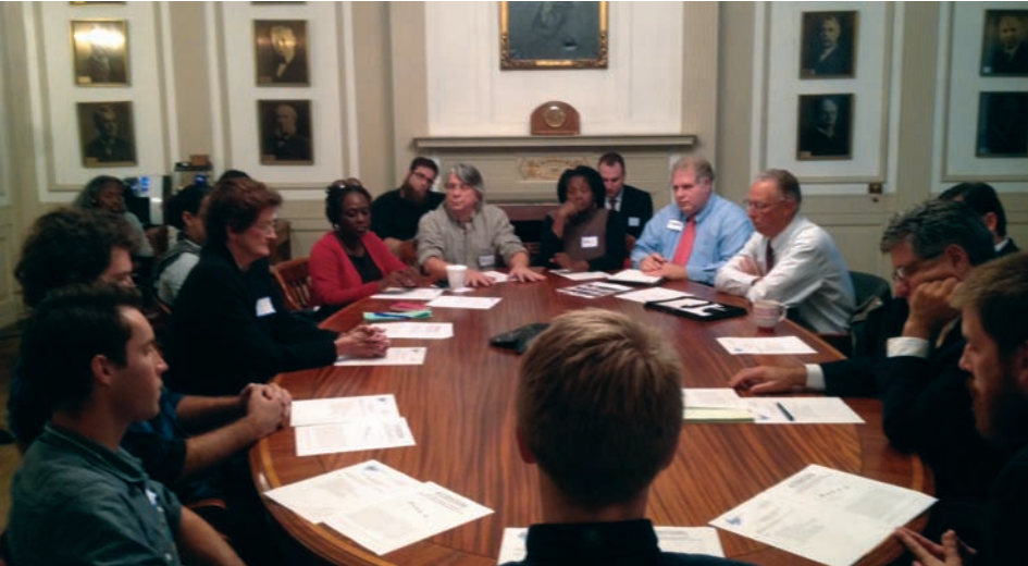
Pittsburgh – Mayor Peduto hosted Penn Avenue stakeholders in his conference room on Oct. 7 to discuss the ongoing Penn Avenue reconstruction project, and how the city can alleviate some of the strain on business owners and residents.

They were missed then. They're missed now.