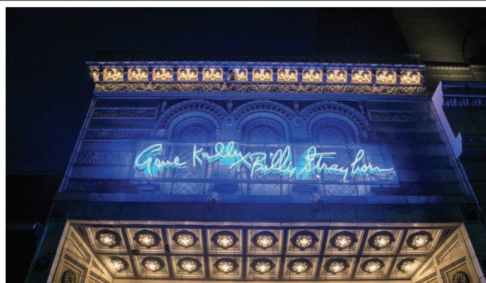
ABOVE: Kelly Strayhorn Theater is celebrating its 100th anniversary with a community time-capsule project, Capsule 15206.

A Publication of The Bloomfield-Garfield-Corporation