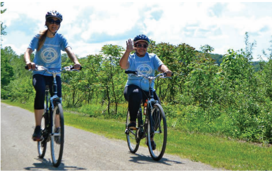
ABOVE: Students explore the Great Allegheny Passage on bicycles. The trip was part of MGR Youth Empowerment's Positive Spin program.