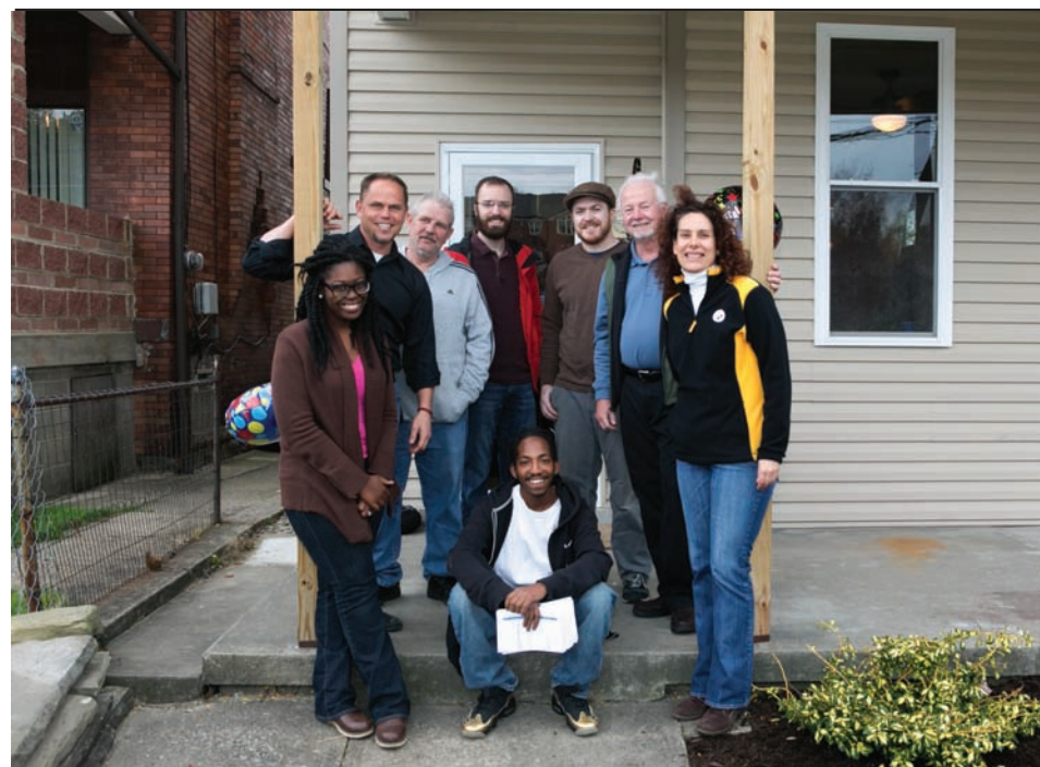
ABOVE: Volunteers, staff, board members and partners of Open Hand Ministries pose at a house dedication event last November. Open Hand Ministries is working with ELDI and other organizations in East Liberty on an upcoming anti-poverty initiative.

chapter of the national anti-poverty program Circles USA will promote collaboration across socioeconomic classes to fight generational poverty in the neighborhood.