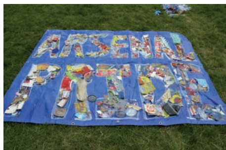
ABOVE: An "Arsenal Pride" banner was created from recycled litter collected by students.