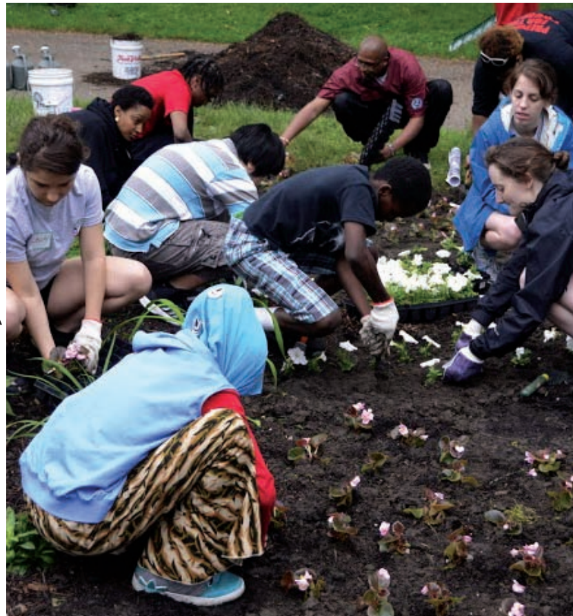
ABOVE: Volunteers plant flowers at Arsenal Park in Lawrenceville. Alongside family members, school staff and community groups, 170 students participated in a service day at the park on May 29.

"That's really cool how the school is named after the arsenal," said sixth grader