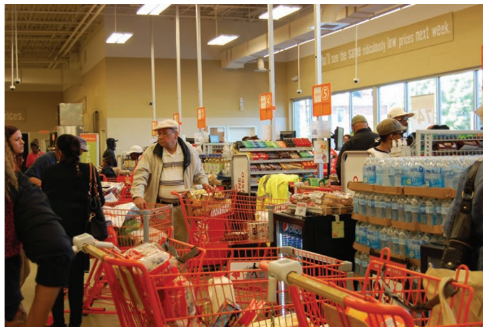
ABOVE: The first 250 customers at Bottom Dollar’s grand opening received gift cards valued at $5 to $250.