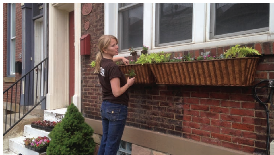
ABOVE: Volunteers planted flower boxes at 30 homes throughout Lawrenceville as part of the Lawrenceville Greenscapes Initiative. Read story on page 2.

A Publication of The Bloomfield-Garfield Corporation