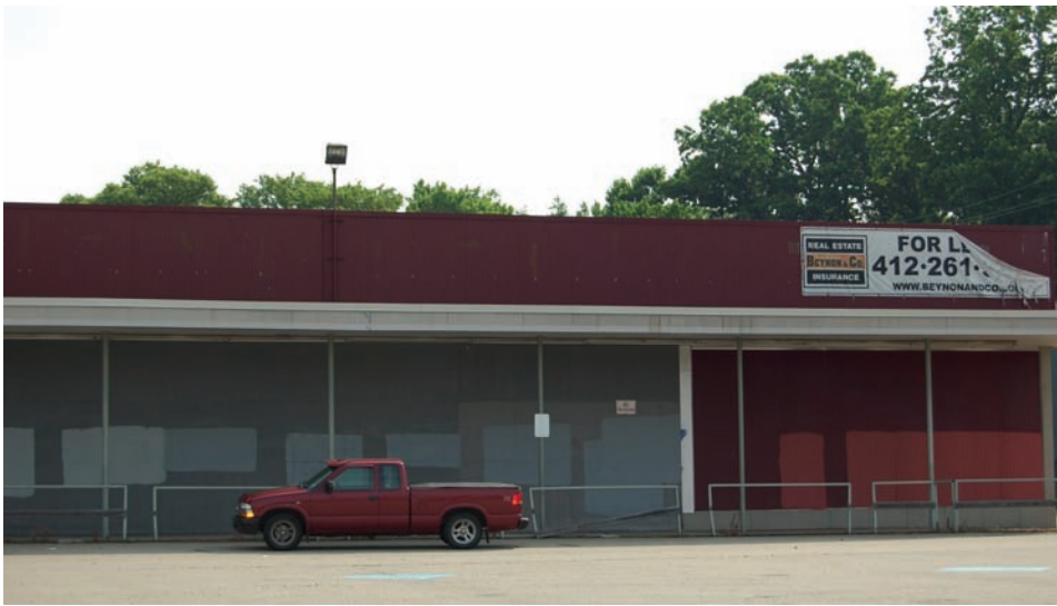
ABOVE: In September, Busy Beaver will open a new store in Lawrenceville.