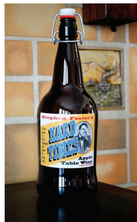
ABOVE: Limited-edition wine growlers will be available at this year's Doo Dah Days.