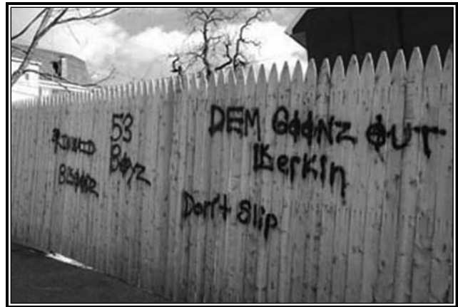
GRAFFITI ACTIVITY IN GARFIELD HAS RECENTLY INCREASED.