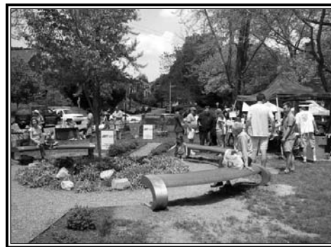
A SCENE FROM THE FRIENDSHIP FLOWER & FOLK FESTIVAL IN BAUM GROVE LAST SPRING.

For more information about the festival or to order flowers call 412-441-6147 x 7 or visit www.friendship-pgh.org .