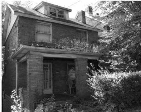
ABOVE: Two trees are swallowing up this neglected house.

Overgrown weeds and debris cover the front yard. The gutters are falling off and the backyard is also overrun with weeds and trash. Neighbors told the BGC staff that people still occasionally visit the