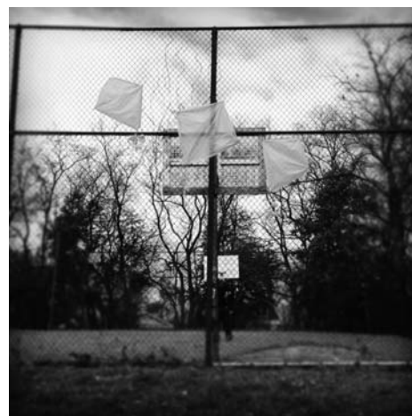
ABOVE: Kite Hill Park sits near the top of Garfield on Rosetta Street.