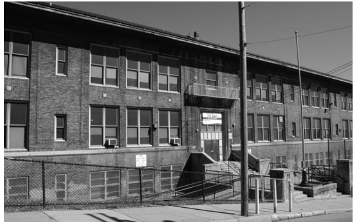
ABOVE: Rogers Middle School on Columbo Street closed in 2009.