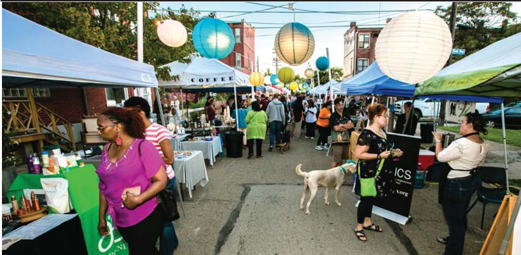
ABOVE: The monthly Garfield Night Market hums with activity. The next market will be held on Oct. 4 from 6 to 10 p.m. in the block of North Pacific Avenue between Penn Avenue and Dearborn Street.

Serving Bloomfield, Friendship, Garfield, East Liberty, Lawrenceville and Stanton Heights Since 1975