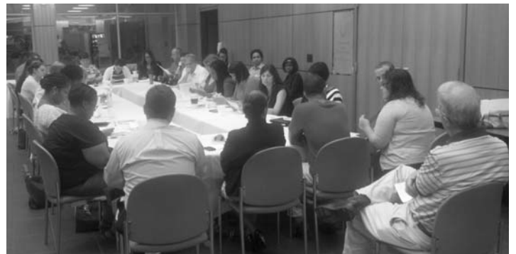
ABOVE: Community organizations gathered to discuss programs aimed at helping youths in foster care succeed in school and the workforce.