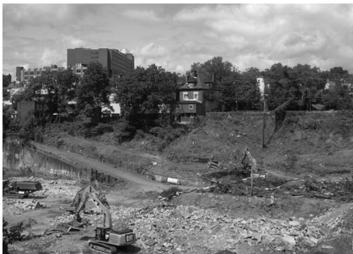
BELOW: Construction of a new UPMC Shadyside garage in Bloomfield began in late July and will continue through the fall of 2014.

few nearby neighbors had begun raising questions about the execution of the project.