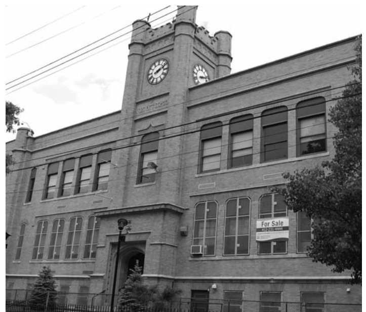
BELOW: Fort Pitt Elementary School on Hillcrest Street has been vacant since 2012.