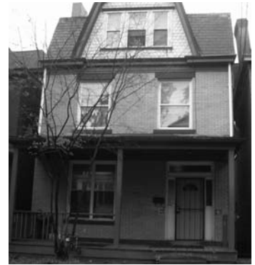
ABOVE: Drug arrests were made at 5416 Broad St. and nearby.