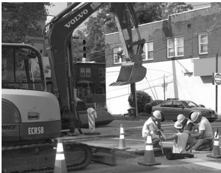
ABOVE: Penn Avenue team doing pre-construction underground testing near the corner of Evaline Street in mid-September.