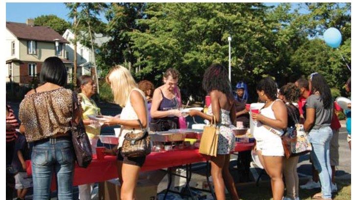
ABOVE: Bloomfield-Garfield Corp's City of Pittsburgh Summer Youth Employment Program participants line up for a picnic dinner and gift bags on their final day of work.

NON-PROFIT U.S. POSTAGE PAID PITTSBURGH, PA Permit No. 2403