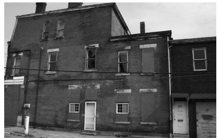
BELOW: The blighted corner of 48th and Hatfield Streets prior to redevelopment; 4750 Hatfield is on the right.

For more information about the tour or to purchase tickets, visit www.lawrencevillehousetour.org . ♦