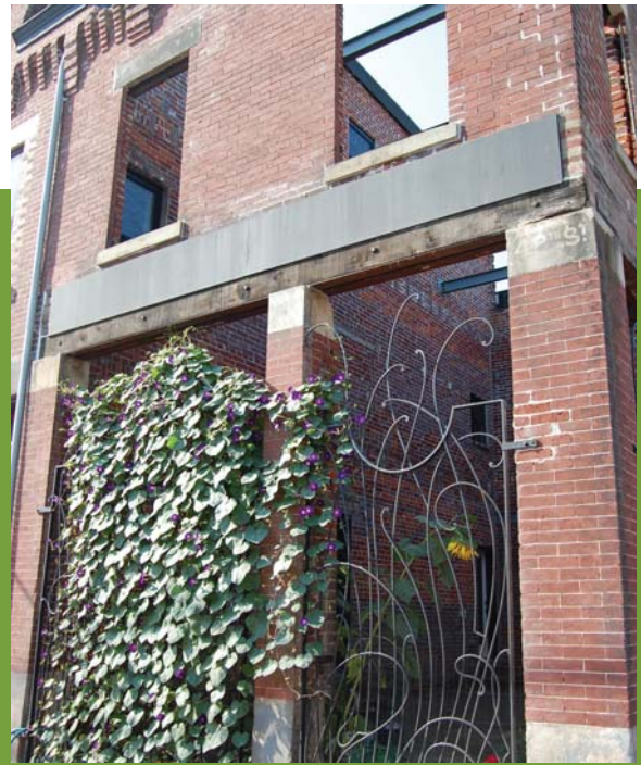
ABOVE: The fenced-in courtyard at the corner of 48th and Hatfield Streets is the focal point of a mini-development.