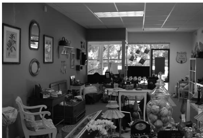
ABOVE: Urban Cottage features one-of-a-kind merchandise to turn a house or apartment into a cozy home, including new and refurbished items.

the store's logo is a bird. "I do have a lot of birds," she laughed. "Birds are classic. They hold up over time."