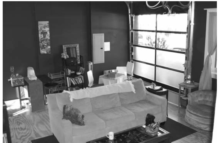
ABOVE: The living room of the house at 4750 Hatfield features a clear garage door that brightens the space.

One of the most unique features of 4750 Hatfield is a clear garage door in the living/dining area, which lifts for air circulation and literally opens the space