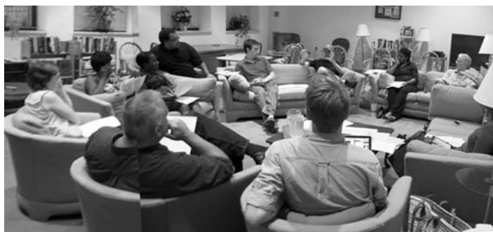
ABOVE: The first meeting of the 6% Place Advisory Committee in August.

Then get counted in the first-ever Garfield Creative Census in October and November.