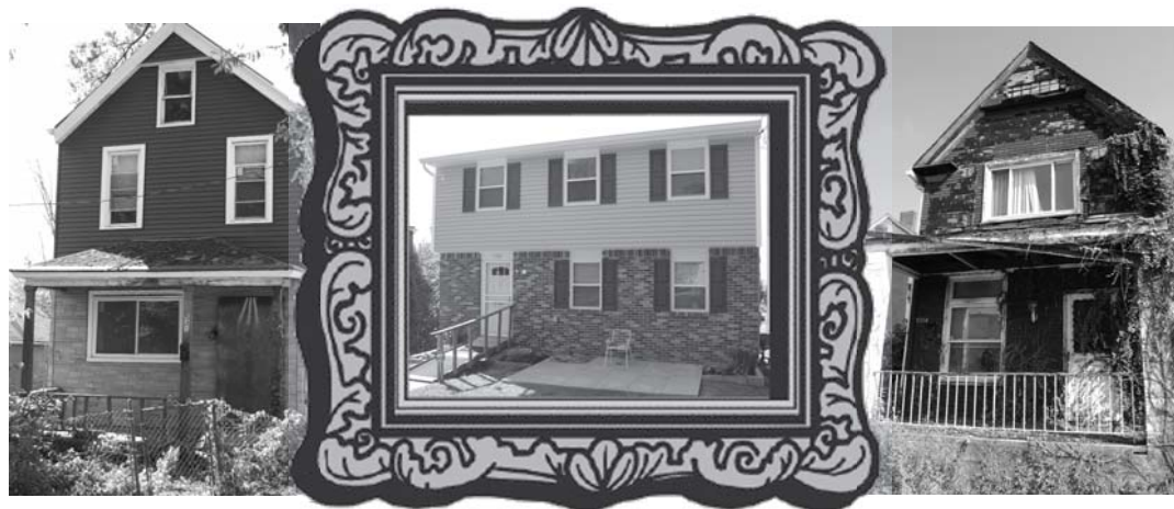
ABOVE: The picture-perfect home at 5310 Hillcrest St. (center) sits between two blighted properties, one of which has an out-of-state owner.