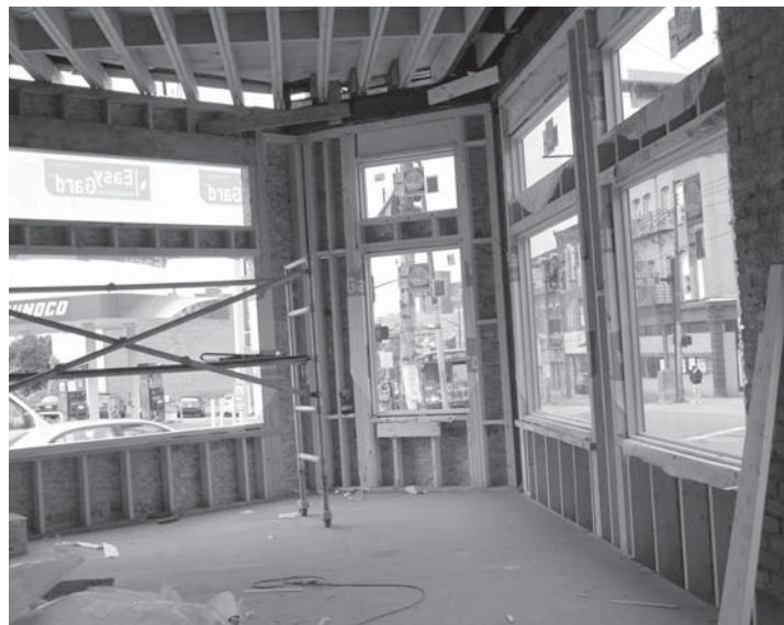
4100 Penn Avenue, once an eyesore, is experiencing a 100 percent rehab, complete with picture windows that provide a panoramic view of Penn Avenue.

The sports bar will have five to six large TV screens and serve cold dishes, since it is not equipped with a kitchen at