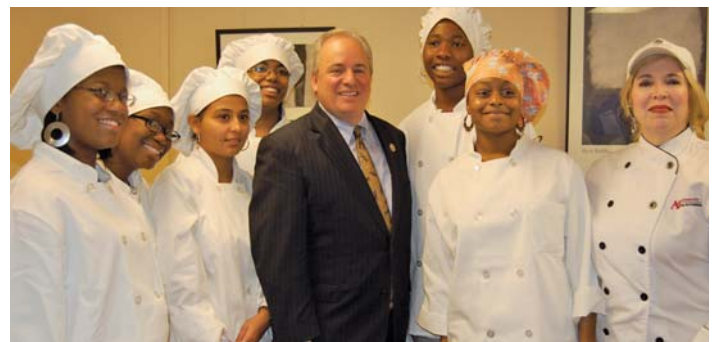
U.S. Rep. Mike Doyle poses with seniors from Pittsburgh Westinghouse High School enrolled in the Culinary Arts program. The students catered the Oct. 20 grand opening of Pittsburgh CONNECTS, Garfield’s new technology center. Read the full story on page 2.

A Publication of The Bloomfield-Garfield Corporation