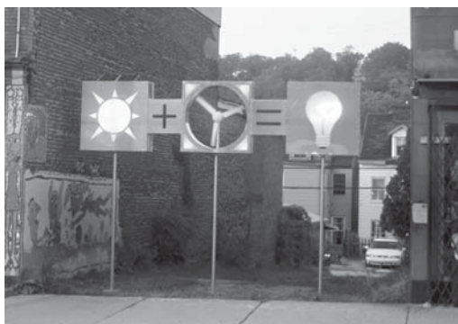
The latest addition to the Green & Screen project is in the 5100 block of Penn.