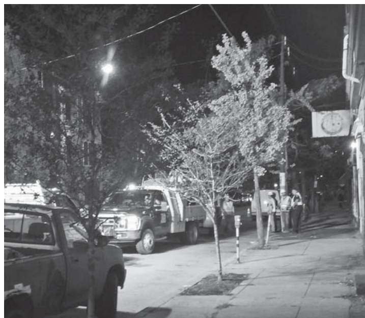
Nighttime geotechnical drilling along Penn Avenue.

At the community meeting in January, detailed plans will be on display, and an open mike session will accommodate questions from the audience. Following the presentation and Q&A, there will be time for residents and business owners to meet with project staff and city officials at separate stations. ♦