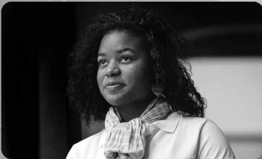
The Young Women's Academy