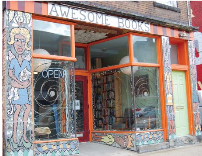
THE COLORFUL, CREATIVE STOREFRONT OF AWESOME BOOKS AT 5111 PENN AVENUE.

The interior is just as interesting and distinctive as the exterior. Walking into Awesome Books, you are likely to be greeted by the resident store cats, Mojo and Cupcake Slim. You'll also find a diverse collection of well-kept and fairly priced used books in almost every subject. The selection changes frequently. According to Bob, the bookstore just celebrated its one-year anniversary; it opened last February on the night of the big blizzard.