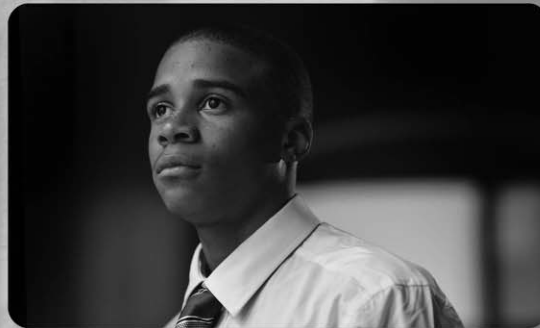
The Young Men's Academy

www.pps.k12.pa.us/academiesatwestinghouse | 412-622-7920