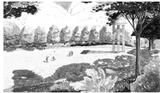
ARTIST'S RENDERING OF HILLTOP PARK.

The idea of establishing a hilltop park around the water tower continues to