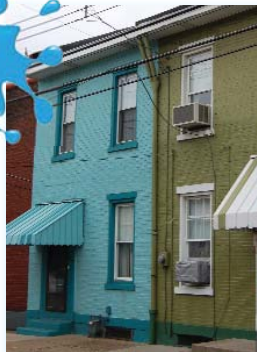
4415 Davison Street