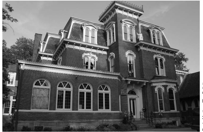
THE MAIN BUILDING ON THE WALDORF SCHOOL CAMPUS DATES BACK TO 1867.