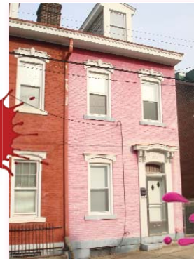
341 Main Street

Driving through the community of Lawrenceville, it is impossible not to notice the big impact of investments by homeowners and business owners. Property owners throughout the neighborhood have been making a statement and beautifying the community with just a few gallons of brightly colored paint. Each home or store that pops up with a fresh, new coat fosters a sense of charm and community pride. As this month's collective showcase, we highlight the many neighbors who have added distinction to their homes or stores, brightening up the streets of Lawrenceville with vivid splashes of color.