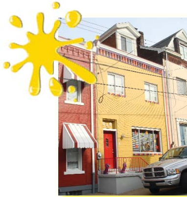
351 Main Street