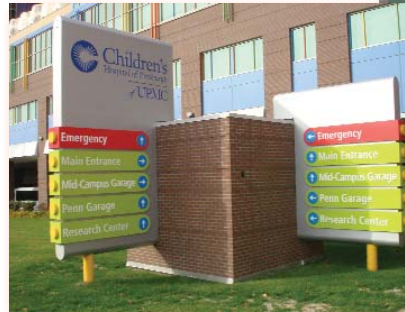
186-188 45th Street