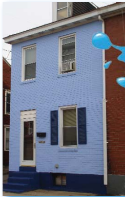
4312 Foster Street