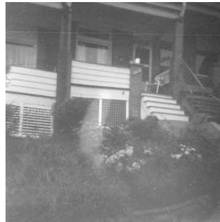
4819 ROSETTA THEN (ABOVE) AND NOW (RIGHT).

Most Garfield residents will not remember the creation of the "plateau," though it remains as a wooded parcel adjacent to Mossfield and North Mathilda. None of the small shops like Flo's