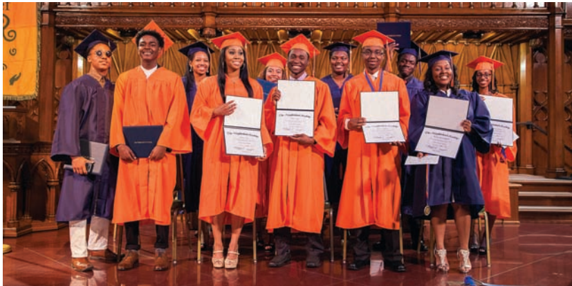
ABOVE: Graduates from the Neighborhood Academy (709 N. Aiken Ave.) proudly display their diplomas as they begin pursuing college plans. Every single graduate from the academy goes on to four-year colleges and universities.