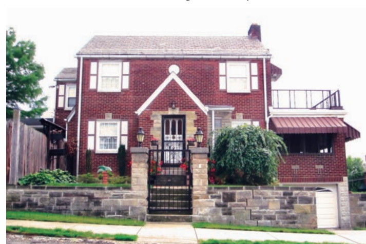
By Aggie Brose Bloomfield-Garfield Corporation

BELOW: Impressive stone and brick features frame this showcase property at 1382 Woodbine St. in Stanton Heights.