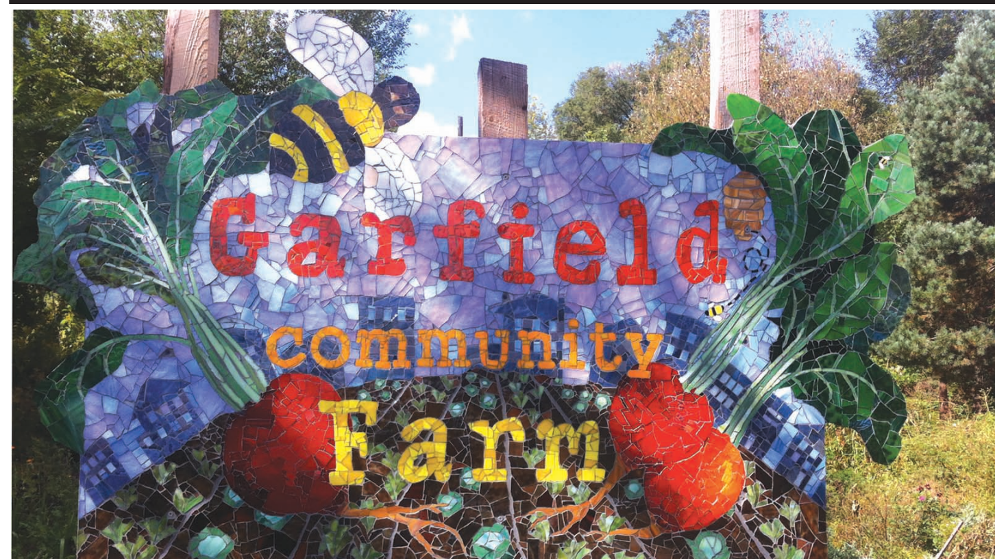
ABOVE: Radishes, bumble bees, and a cityscape decorate the new mosaic sign welcoming visitors to Garfield Community Farm (Wicklow and Columbo Sts.). New amenities, like a labyrinth and picnic pavilion, have been incorporated to transform the farm into a community gathering space while retaining its original gardening function. Read more on page 10.