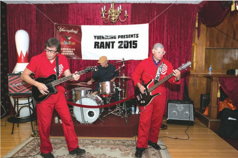
ABOVE: Vertigo-Go performs at Arsenal Lanes bowling alley (212 44th St.) during Lawrenceville's Rock All Night Tour (RANT) festival on August 15.

GARFIELD Characters of the Bible Morningside Church of God in Christ (5173 Dearborn St.) presents "The Characters of the Bible" at 3:30 p.m. on Sunday, September 13th. Come bring your family and friends and be blessed as you see some of the greatest characters of the bible come to life before your very eyes.