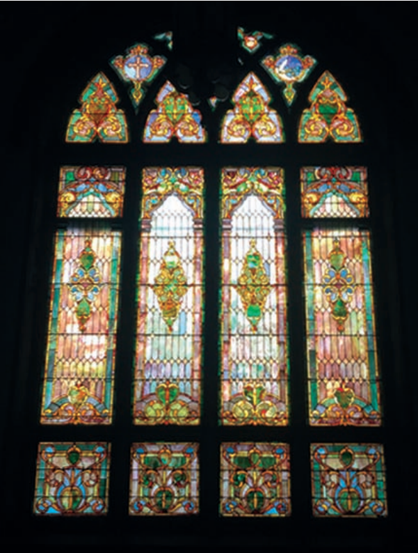
ABOVE: Albright's parishioners miss the sunlight streaming through stained glass in their beloved old house of worship at 486 S. Graham St.