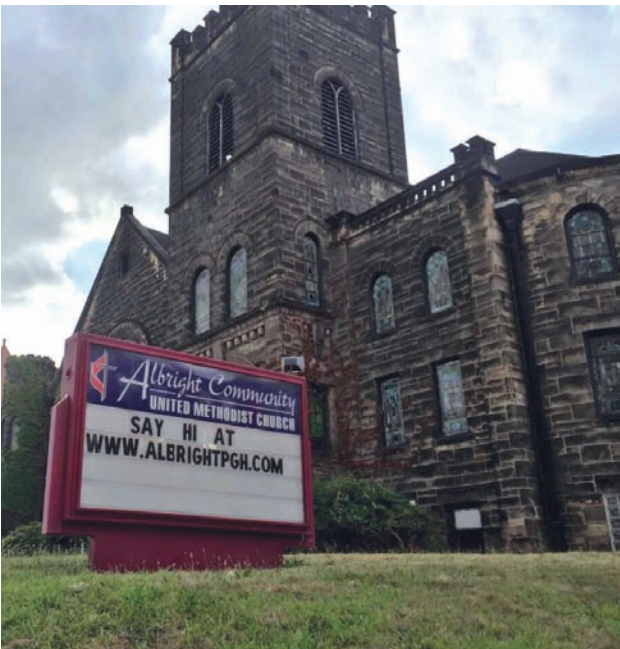
AT LEFT: Clouds loom over the 109 year-old church building that houses the Albright Community United Methodist congregation. A local real estate firm is keen on purchasing the property at 486 S. Graham St. in order to bulldoze the church and build a coffee shop in its place. Plans calling for a drive-thru window require a special exception to the Pittsburgh Zoning Ordinance. As of press time, the exception was still under consideration by the City's zoning board.

Readers interested in volunteering are encouraged to visit http://AlbrightPgh.com . Information is also available via Facebook on the Save Albright United Methodist Church page and on Twitter (@AlbrightPgh). ♦