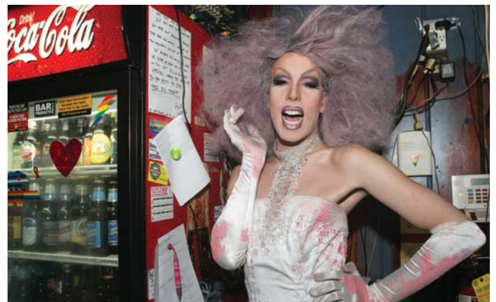
ABOVE: Nationally known drag performer Alaska, an East End resident, is competing in "RuPaul's Drag Race" on television. See the full story on page 12.

NON-PROFIT U.S. POSTAGE PAID PITTSBURGH, PA Permit No. 2403