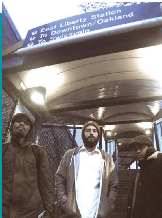
ABOVE: The East Liberty Quarters: BusCrates 16-Bit Ensemble, Nice Rec and Grand Ear.