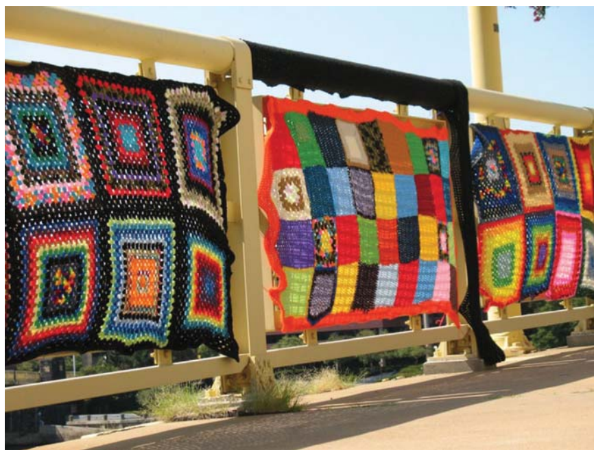
ABOVE: Knit the Bridge, a project featuring the work of hundreds of local knitters and crocheters, will present a special event at GA/GI 4.

The Pittsburgh Glass Center, which always plays a pivotal role in GA/GI, is exhibiting work by the internationally known artist Eunsuh Choi. PGC will also