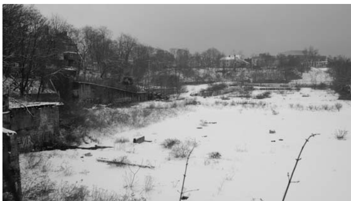
ABOVE: This expansive vacant lot in Bloomfield, seen here from Gross Street, will be the site of a staff-only parking garage for UPMC Shadyside.

variety of concessions. These included reducing the size of the proposed parking garage, eliminating access points to the garage from residential streets and jettisoning plans for a surface parking lot.