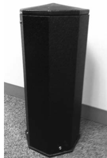
ABOVE: Duquesne Light will use these octagonal fiberglass utility poles along Penn Avenue instead of wooden ones.

A final public meeting will take place this summer to present the plans for the project to the community, including an overview of the different stages of construction and the rerouted traffic patterns. Watch The Bulletin for an announcement of the meeting date. ♦