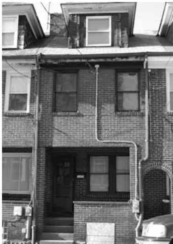
ABOVE: With rotting gutters and trim and broken windows, this Lawrenceville house is truly an eyesore.

Homeowners on the street reported observing drug deals on the property. Also, during this period of vacancy, someone set a fire inside that was extinguished before impacting the entire row. Fortunately, a