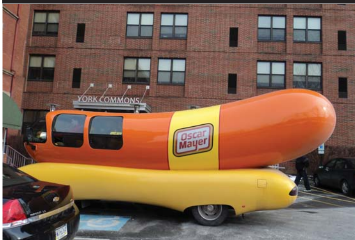
ABOVE: On Feb. 7, the Oscar Mayer Wienermobile visited Lawrenceville – with a stop at York Commons, where it made a three-point turn in the parking lot – to help with local Meals On Wheels deliveries.

Serving Bloomfield, Friendship, Garfield, East Liberty, Lawrenceville and Stanton Heights Since 1975