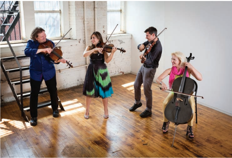
ABOVE: Members of Ethel will perform as part of Chamber Music Pittsburgh’s “Just Summer” series at KST.

East Liberty – As the spring season winds to a close, Kelly Strayhorn Theater (KST) prepares for another big summer full of performances, music and celebrations. Formerly known as Celebrate East Liberty, KST’s East Liberty LIVE! presents an exciting summer arts series that contributes to the sustained vitality of East Liberty and the East End.