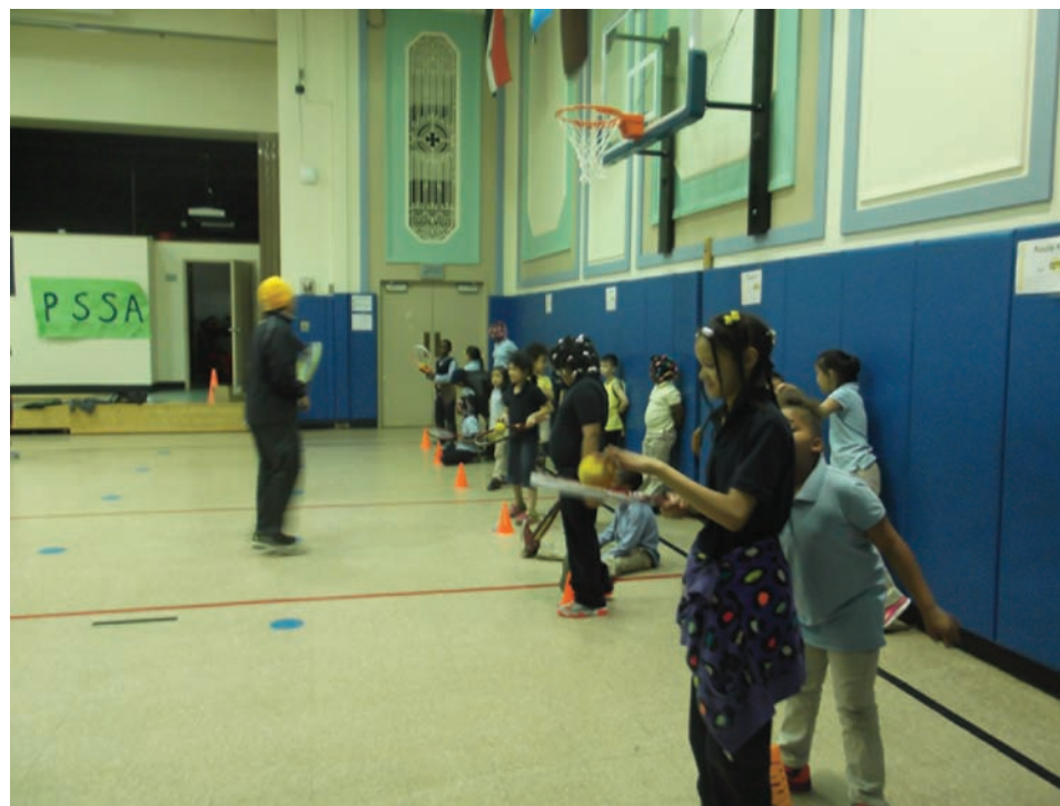
ABOVE: Students at Pittsburgh Arsenal PreK-5 practice their balance and ball handling during a four-week afterschool tennis program.

The inclusiveness and universality of the sport is perhaps best demonstrated by the