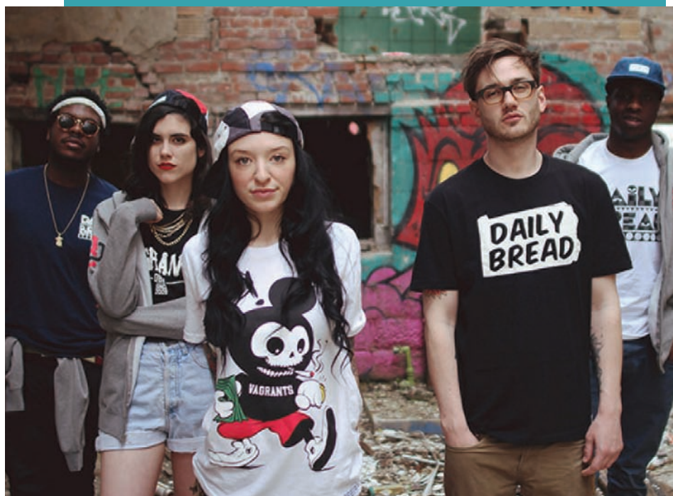
ABOVE: Streetwear designed by the team at Daily Bread on Penn Avenue.

Daily Bread prides itself on taking street-wear classics – hats and T’s – and putting