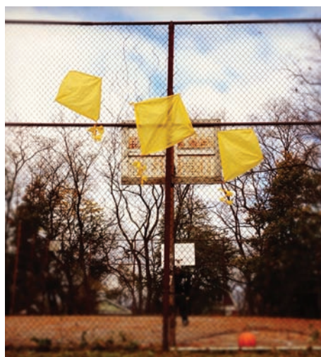
ABOVE: Residents say they want Kite Hill to remain a park.

ment could occur, however, the BGC chose to seek input from nearby neighbors about their wishes for the park and the proposed development. On May 5, a community meeting was held at Brothers and Sisters Emerging on Hillcrest Street. All nearby neighbors were invited to learn about the housing plan and share their opinions.