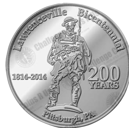
ABOVE: Proof of the front and back of the Lawrenceville bicentennial coin minted by Challenge Coins R Us. The coins will be sold for $15 each at Doo Dah Days in Allegheny Cemetery on July 12th. The silver coin is 1.75" in diameter.

soldiers on the grounds currently occupied by Foster Community Center on Main Street in Lawrenceville.