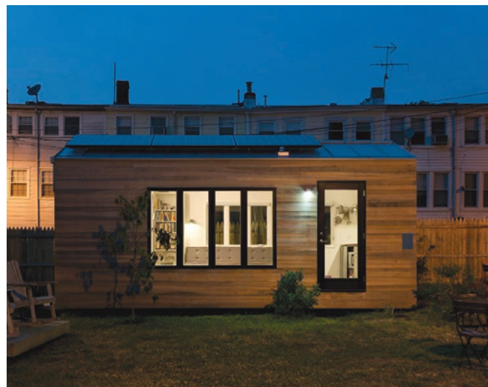
ABOVE: A contemporary design called "Minim" was the overwhelming favorite of attendees at the May 13 Tiny House Planning Session held by cityLAB.

North Atlantic Avenue near Dearborn Street.