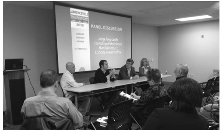
ABOVE: Community leaders answered questions from participants during the Landlord Assistance Program.

Lawrenceville – Lawrenceville United has been working since early 2010 with the Lawrenceville Public Safety Action Team to confront blight and crime in the Lawrenceville community and to encourage community revitalization. Most recently, this team put together a Landlord Assistance Program to help foster responsible property management in the neighborhood, where 56 percent of housing consists of rental properties.