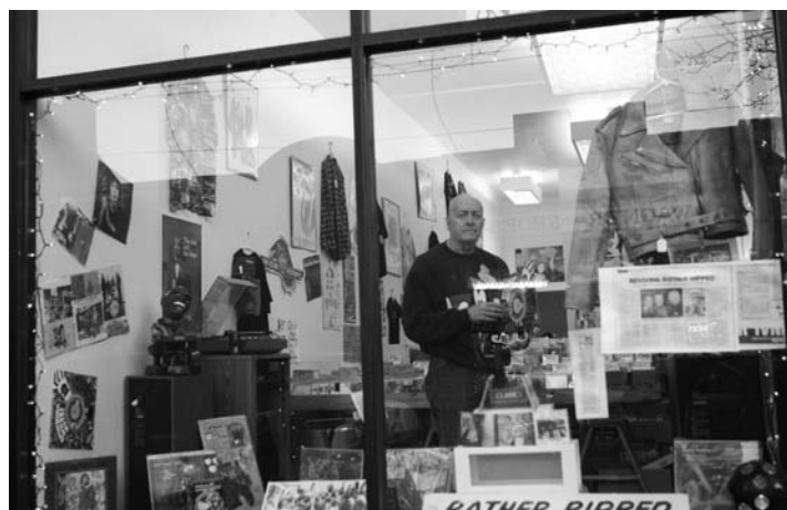
ABOVE: The view into the store from Butler Street.