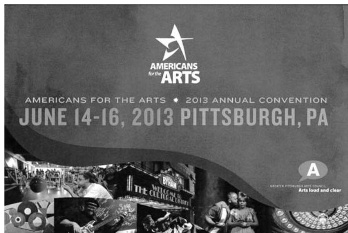
ABOVE: Americans for the Arts brings its national conference to Pittsburgh in June.