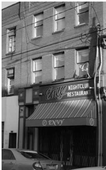
ABOVE: An upscale, Hawaiian-themed restaurant called Saiman will be located at the Penn Avenue address once occupied by the nightclub Envy.

• The BGC, in conjunction with the Mayor's Office, is exploring the option of holding a gun buy-back this year, similar to ones held in the North Side community in previous years.