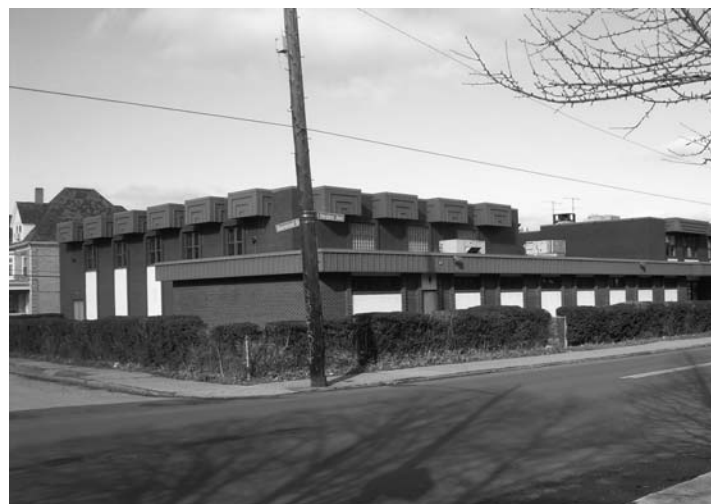
ABOVE: Mt. Ararat Baptist Church hopes to move some of its programs and services to the vacant Craig House Academy building on North Negley Avenue.

Craig House Academy moved its school from Highland Park in 2010 to a new facility at S. Negley and Friendship Avenues less than a mile away, renaming it Friendship Academy in the process. The building was eventually sold by the Watson Institute, the parent arm of Craig House, at auction in 2011 to a private investor. However, a recent search of Allegheny County's assessment registry failed to locate any record of the building. ♦