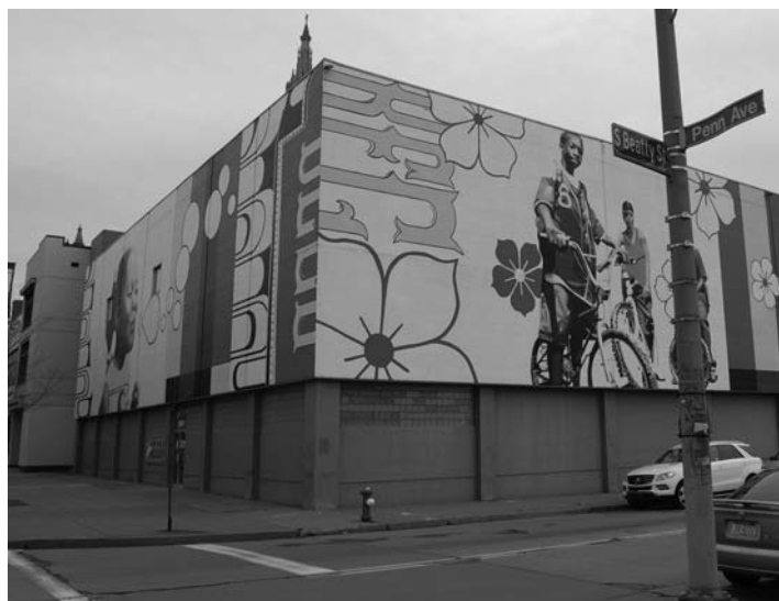
ABOVE: The building housing Novum Pharmaceutical Research Service is immediately recognizable for its colorful mural, "Lend Me Your Ears."

For more information about being a volunteer in a Novum trial, call 1-800-586-0365.