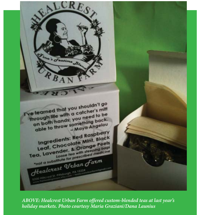
ABOVE: Healcrest Urban Farm offered custom-blended teas at last year's holiday markets.

Although most of their teas are herbal blends, the bestsellers, says Graziani, include a black tea made with chocolate mint and raspberry leaf, and a coconut chai made with a green tea blend that is low in caffeine. Other ingredients from the farm that they use in their teas include perennial herbs such as nettle leaf, red clover, calendula, several mints, sage and rosemary, plus fruits such as raspberries, black-