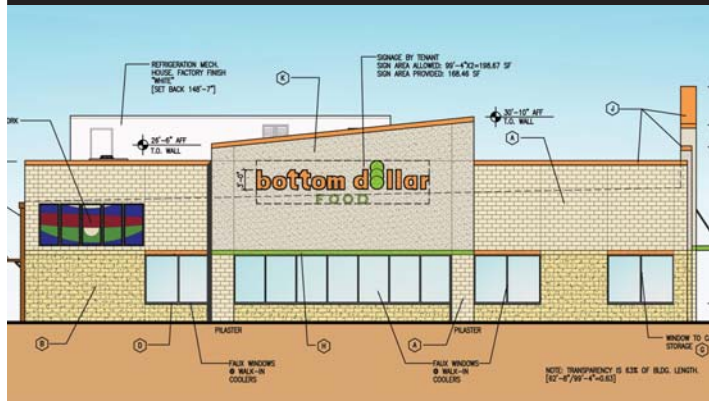
ABOVE: Penn Avenue elevation of the proposed Bottom Dollar store at 5200 Penn, to be part of the presentation at the August 2 zoning hearing. See story below.

Serving Bloomfield, Friendship, Garfield, East Liberty, Lawrenceville and Stanton Heights Since 1975