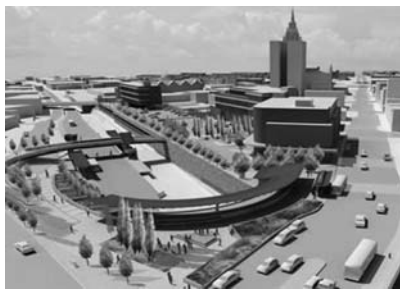
ABOVE: Artist's rendering of proposed East Liberty Transit Center.

bridges, increased secure bicycle parking and improved bus shelters. It will be part of the Eastside III redevelopment, a privately funded project from The Mosites Company. This development will bring short- and long-term jobs to East Liberty, further sparking neighborhood growth.