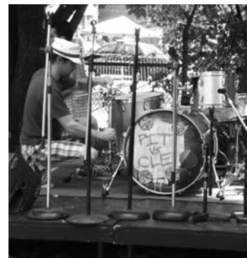
ABOVE: The stage being set up for the Battle of the Bands between Pittsburgh's Grand Snafu and Cleveland's Night Sweats at the Waterloo Arts Fest.

Though many of the events were advertised as "battles," Jason Sauer said, "It's not a battle. It was a competition of sorts, but friendly, between the Pittsburgh and Cleveland arts districts." Instead of a battle, he called it "Rustbelt Rivalry." ♦