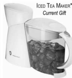
ICED TEA MAKER* Current Gift

*Available when you open a new checking account and add one of the following: Direct Deposit, Online Banking, Bill Pay or Visa® Check Card. We reserve the right to substitute an item of similar value.