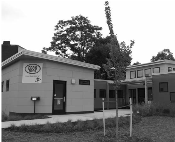
ABOVE: The EECO Center stands on the site of a former gas station at the intersection of East Liberty Boulevard and Larimer Avenue.