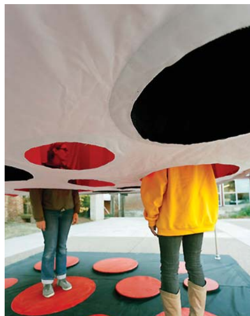
ABOVE: Kids and adults can explore unusual spaces and artful experiences at Leslie Park Pool just by “popping up” in the Mattress Factory Art Museum’s mobile fabric installation tent.

This project is funded and supported by The Heinz Endowments Small Arts Initiative, PA Council on the Arts, Pittsburgh