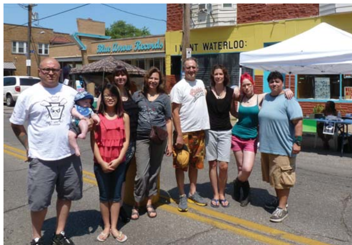
ABOVE: The artists from Garfield's Most Wanted Fine Art Gallery at the Waterloo Arts Fest.