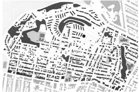
THE LIGHT GRAY AREAS ON THIS MAP SHOW THAT ONLY 1.8 PERCENT OF GARFIELD'S TOTAL AREA CONSISTS OF PARKS AND PLAYGROUNDS. THE DARKER AREAS INDICATE WOODLANDS.

One hurdle to building the Hilltop Park is that the Housing Authority of Pittsburgh owns the land and plans to build Phase IV of Garfield Commons on the site. Attendees suggested that the Housing Authority could move some of the housing down the hill into the neighborhood, continuing the work of BGC, Garfield Jubilee, and private efforts.