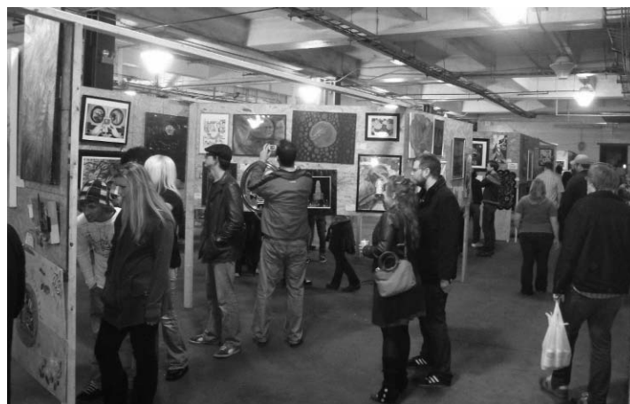
A SCENE FROM LAST YEAR'S ART ALL NIGHT.

To learn more about the event, including how to register artwork and how to get involved as a donor or volunteer, visit www.artall-night.org .