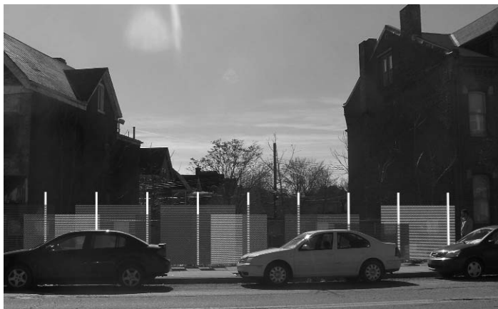
CONCEPTUAL DESIGN FOR TEMPORARY GREEN AND SCREEN PROJECT NEAR QUIET STORM, SET FOR COMPLETION IN EARLY MAY.

There is a new Green and Screen project on a fast track at 5416-5420 Penn Avenue near Quiet Storm Restaurant. The project, proposed by local artist/architect Raedun Knutsen, is on track for completion before the May "Unblurred: First Fridays on Penn" activities.