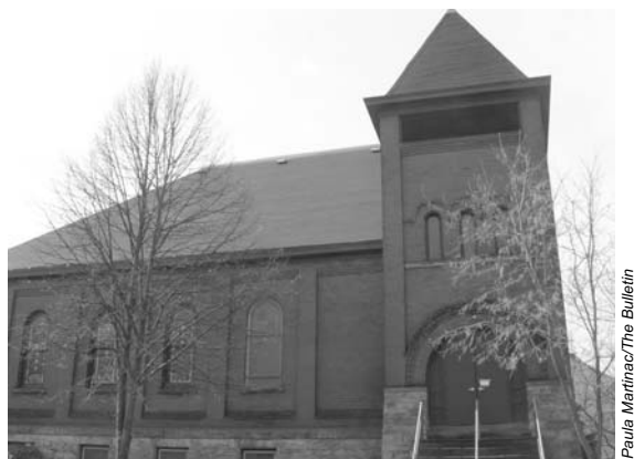
ST. MARK'S AME ZION CHURCH IN LAWRENCEVILLE WAS BUILT AT THE END OF THE 19TH CENTURY.

Many organizations provided support for the printing and distribution of 5,000 tour guides for students in the Pittsburgh region, including the Pennsylvania Historical and Museum Commission, the Pennsylvania Dept. of Community and Economic Development, The Poise Foundation, CMU's Center for African-American Urban Studies and the Economy (CAUSE), and the University of Pittsburgh's History Department. The guide was unveiled at a ceremony at the August Wilson Center at the end of February, and released in early March. The sites can also be viewed online at www.youngpreservationists.org .